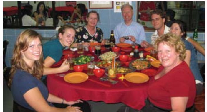
Hanze staff and students enjoying dinner at Bukit Bintang

Training team to support the end users with additional training materials such as e-learning courses, classroom courses, manuals and hints and tips.